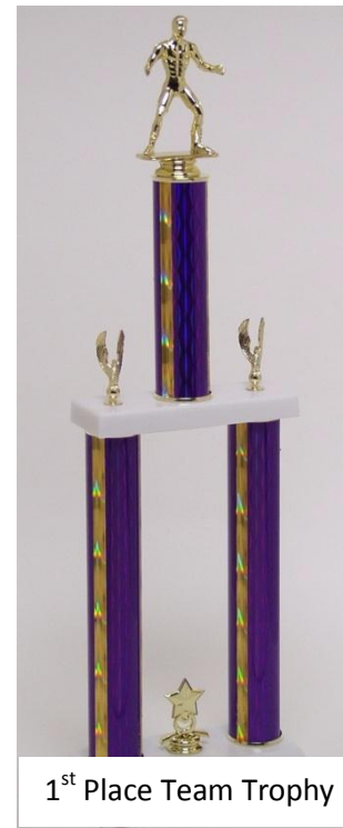
1 st Place Team Trophy

TEAM Trophies will also be awarded for 6U, 8U, 10U, 12U & 14U Divisions.