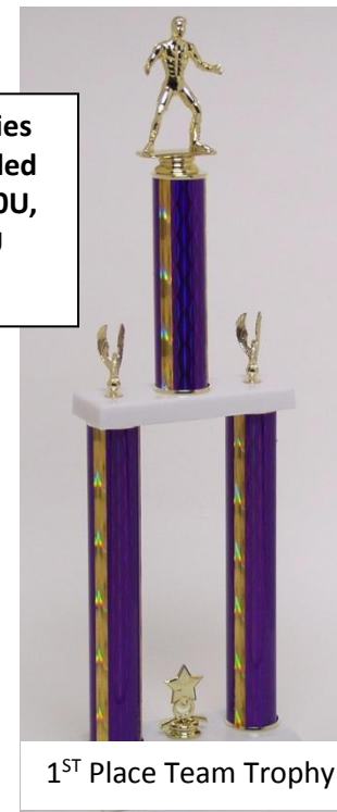
1 ST Place Team Trophy

TEAM Trophies will be awarded for 6U, 8U, 10U, 12U & 14U Divisions.